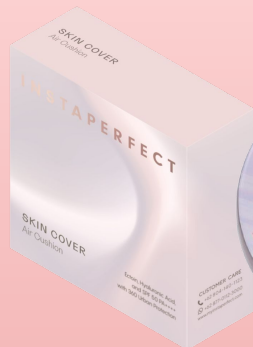
Design Pack Primer & Unit Box