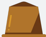
Roasted Oolong Milk Tea