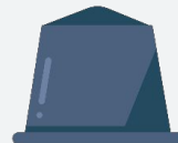
Jamu Masuk Angin