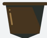
Double Power Blend