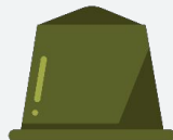
Kyoto Matcha Latte