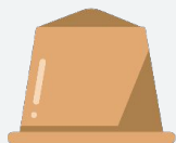
Aceh Gayo Highland