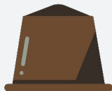
Never Ordinary Blend