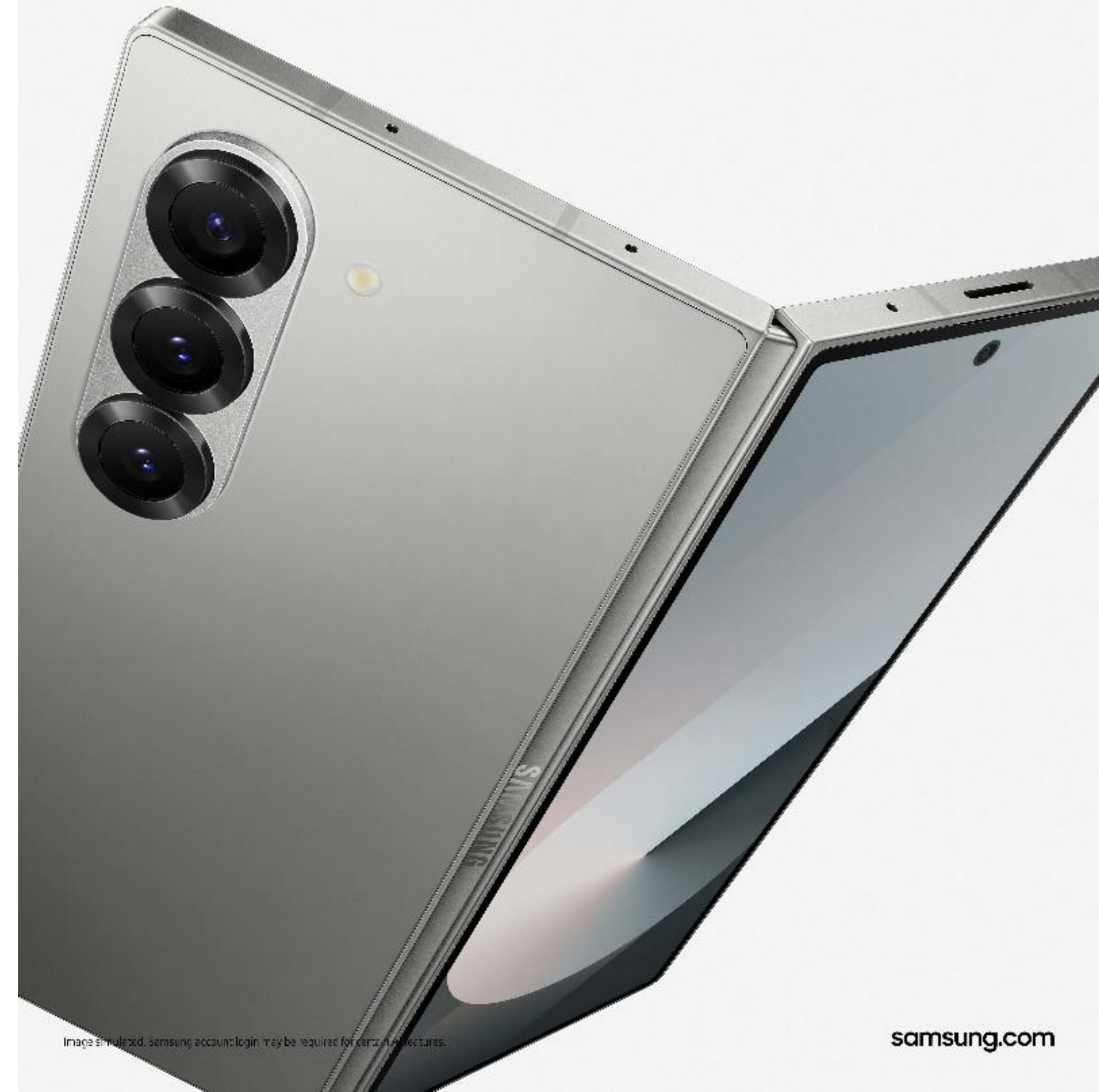
Image simulated. Samsung account login may be required for certain features.