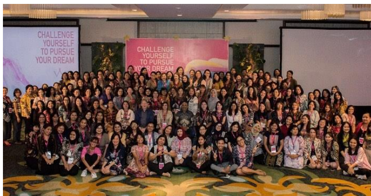
With theme "Challenge yourself to pursue your dream"