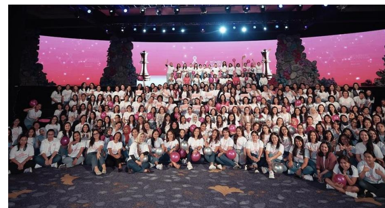
With theme "Be the game changer"