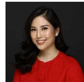
Angela Tanoesoedibjo Deputy Minister of Tourism and Creative Economy